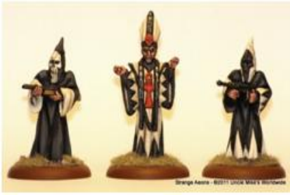
Cultists: Characters Uncle Mike's Strange Aeons