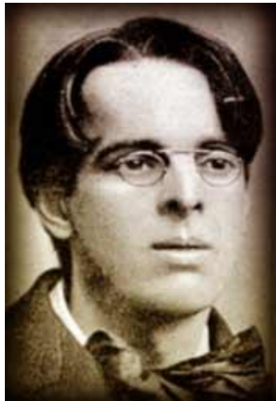
William Butler Yeats