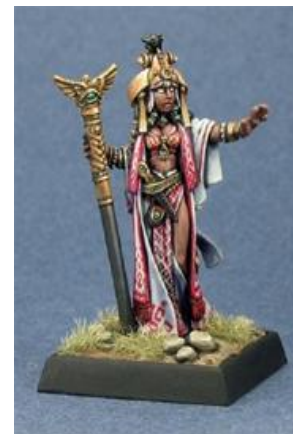
Pathfinder Miniatures Alahazra, Iconic Human Oracle

Priestess figures with an Egyptian flavor for Florence Farr? Possible additions would be some kind of a mask to hide her identity, although the headdress and black wig could be enough. Or she could be in a robe and hood like everyone else. I like these two options, though.